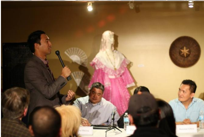
Panelists and audience participate intently at the Filipino-American Experience - A Panel Discussion on Race, Immigration and The American Dream. Hosted last March 28 by the Filipino Association of Greater Kansas City as part of the Your Fellow Americans project.