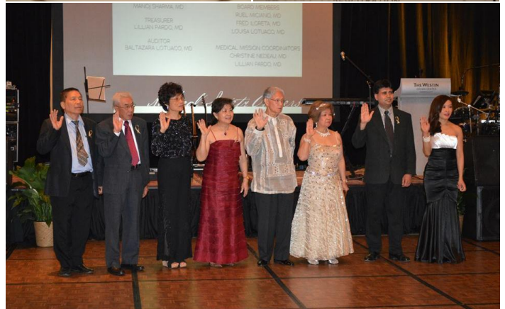
Incoming officers of the Philippine Medical Society get sworn in at their Raising Hope Gala held last March 15.