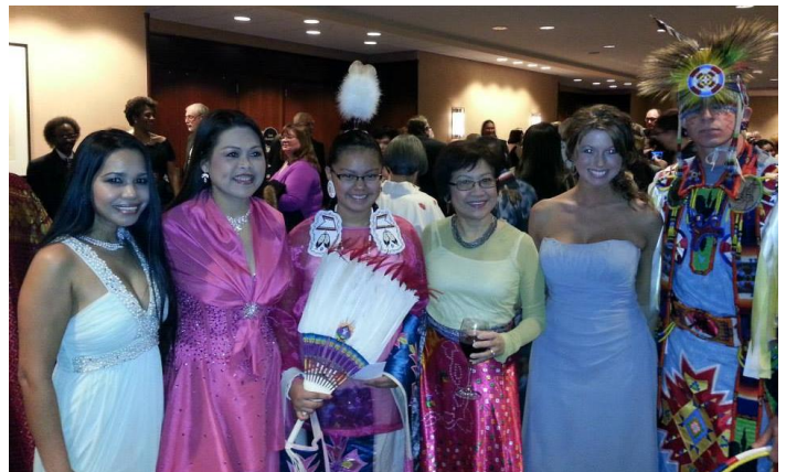
Some members of our Philippine delegation pose with other attendees at the Ethnic Enrichment Diplomatic Ball last March 1, celebrating KC's diversity.